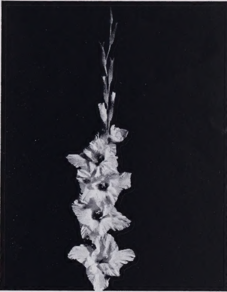
DISCOVERY (From a small bulb)